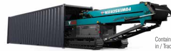
Containerised shipping, Track in / Track out. No crane required.