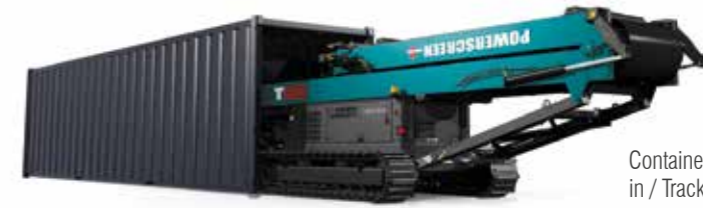
Containerised shipping, Track in / Track out. No crane required.